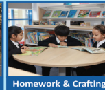
Homework & Crafting