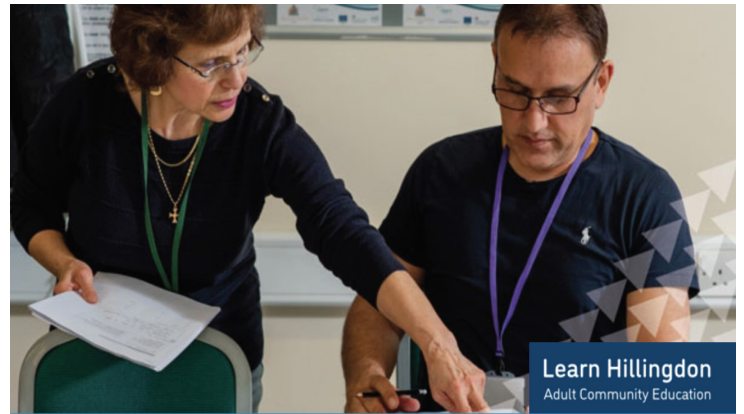
Learn Hillingdon Adult Community Education

Ready to boost your digital skills? Hillingdon are offering free digital skills workshops for adults! Join Learn Hillingdon's fully funded Digital for Life courses. Delivered in a supportive and encouraging environment, these courses are designed to enhance your knowledge and skills in our ever-changing digital world. Plus, you'll receive guidance on your next steps to ensure you continue to thrive in the digital world. Visit our website for more information: https://www.therosedalehewensacademytrust.co.uk/learn-hillingdon-free-digital-skills-workshops-for-adults